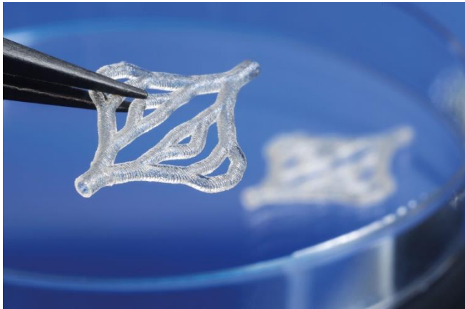
Image 1: The aim is to use the combi-machine to produce branched microtubes as well as complete microfluidic systems.

EUROPEAN UNION Investing in our Future European Regional Development Fund